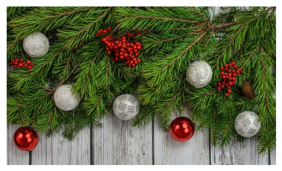
December 2 - 6:30 pm Outreach Christmas Dinner in support of Emmanuel House (Stella's Circle)

December 8 - 8 to 11 am Men's Club Breakfast with Santa